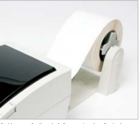
A wide range of options, including an external media stand