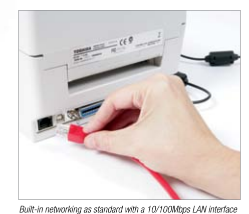
Built-in networking as standard with a 10/100mbps LAN interface