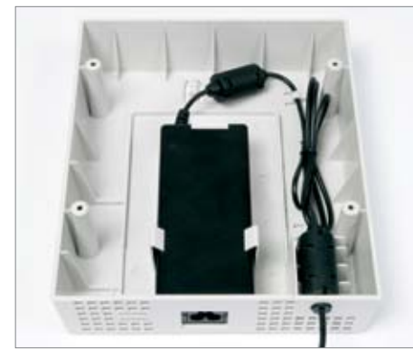
An optional power supply tray for retail installations