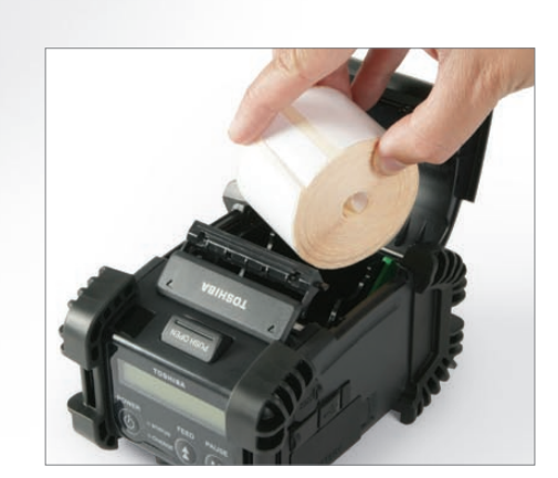
Market-leading media capacity for fewer roll changes