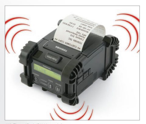
Wi-Fi certified (GH40 model)