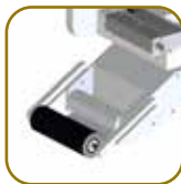
HIGH PRECISION RIGID