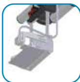
MINI EASY JET