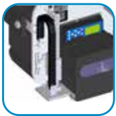
HIGH PRECISION SAFE