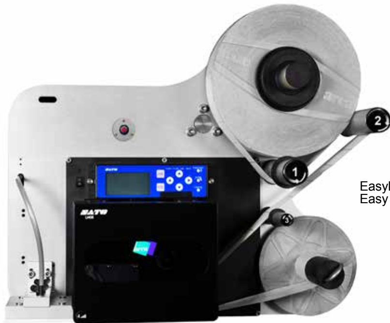
Easyliner with Easy Jet

All the rollers that guide the liner are capped to avoid the deposit of dirt. Sequential numbering or special diagrams facilitate machine set up