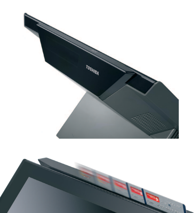
Optional MSR and/or customer display