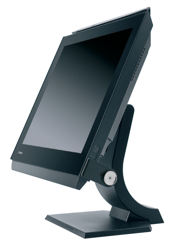
Countertop configuration with optional stand.