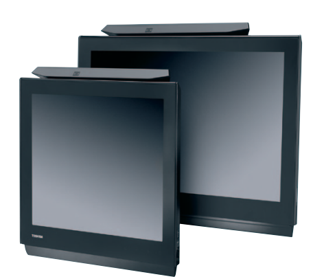
Kiosk configuration landscape viewing