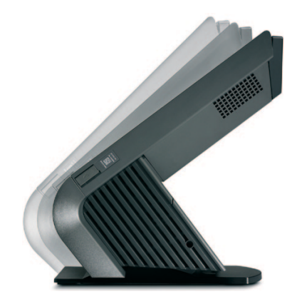
Multiple viewing angles and heights