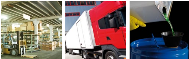
* The B-EX4T2 was benchmarked against competitor products in stand-by mode.